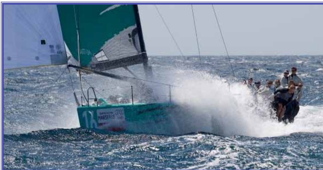
"QUANTUM RACING' Pressing on!