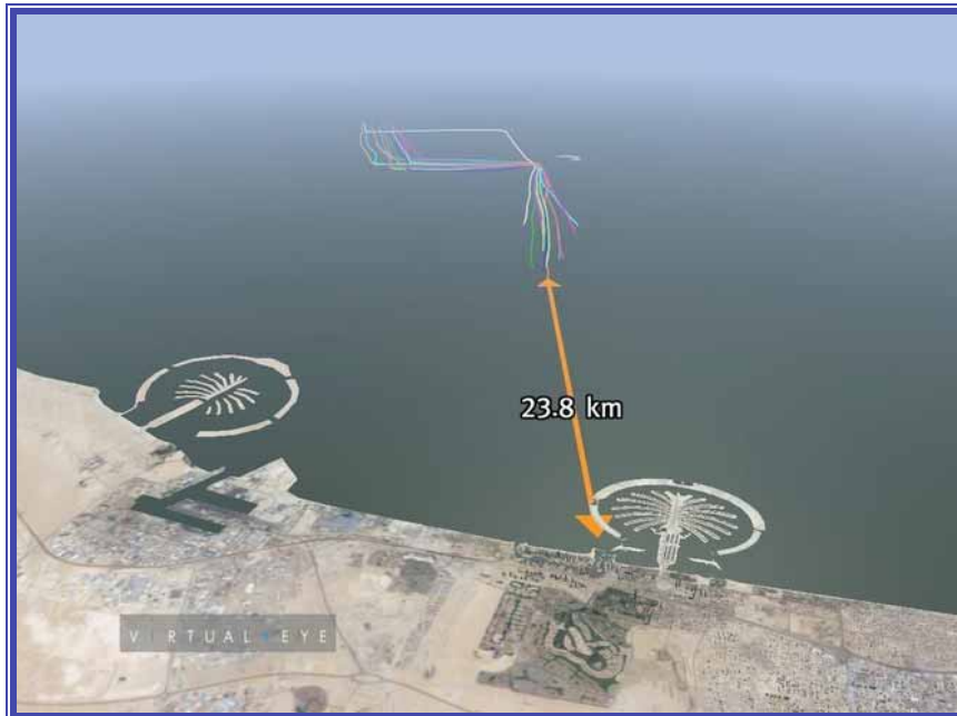
The fleet heads for Dubai, VIRTUALLY.