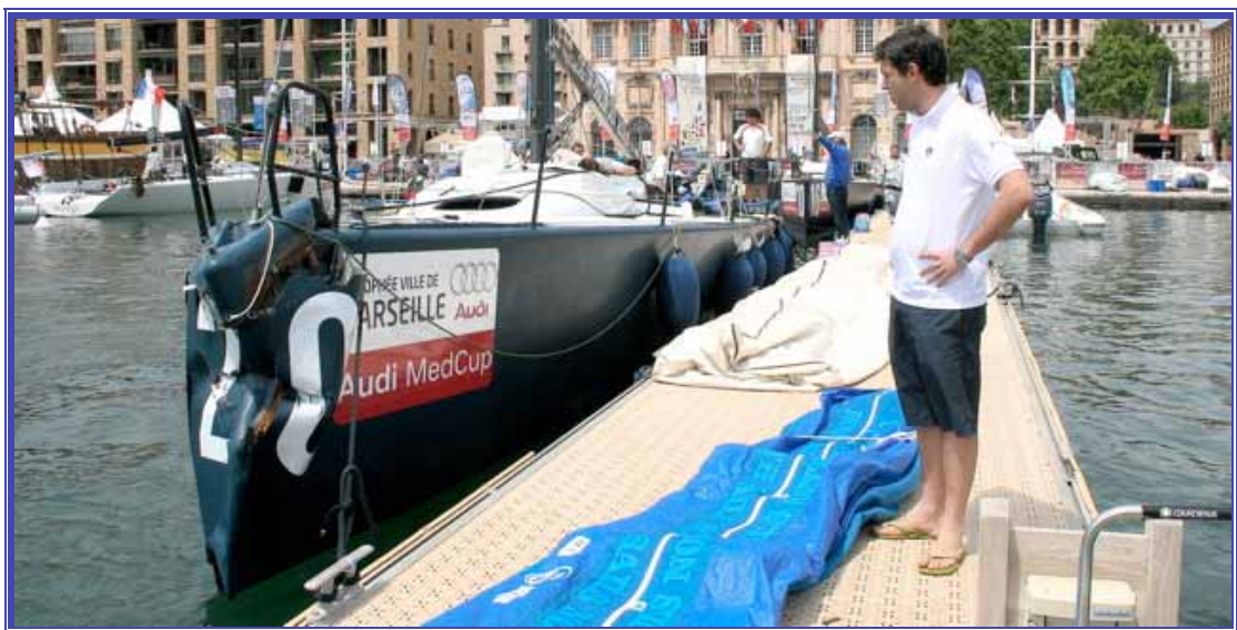
Damage to 'CXG CAIXA GALACIA'.