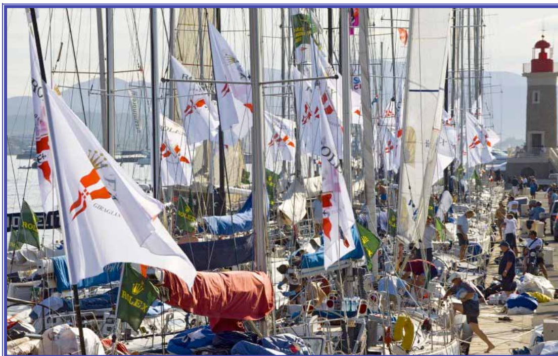
The busy ST. TROPEZ dockside.