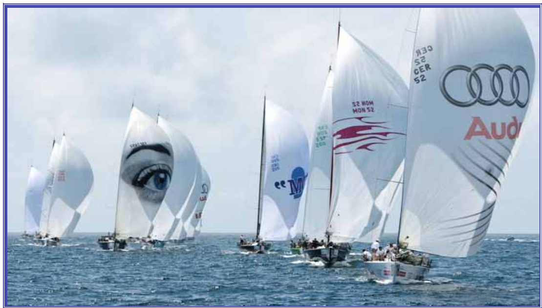
'PLATOON' & 'MEAN MACHINE' lead in the practice race.

While it was a gentle introduction for Ellison, Coutts and Co. to their new boat and the rest of the fourteen-boat fleet, local forecasters and team navigators were predicting at least 20 knots of Mistral breeze for the next day's opening races.