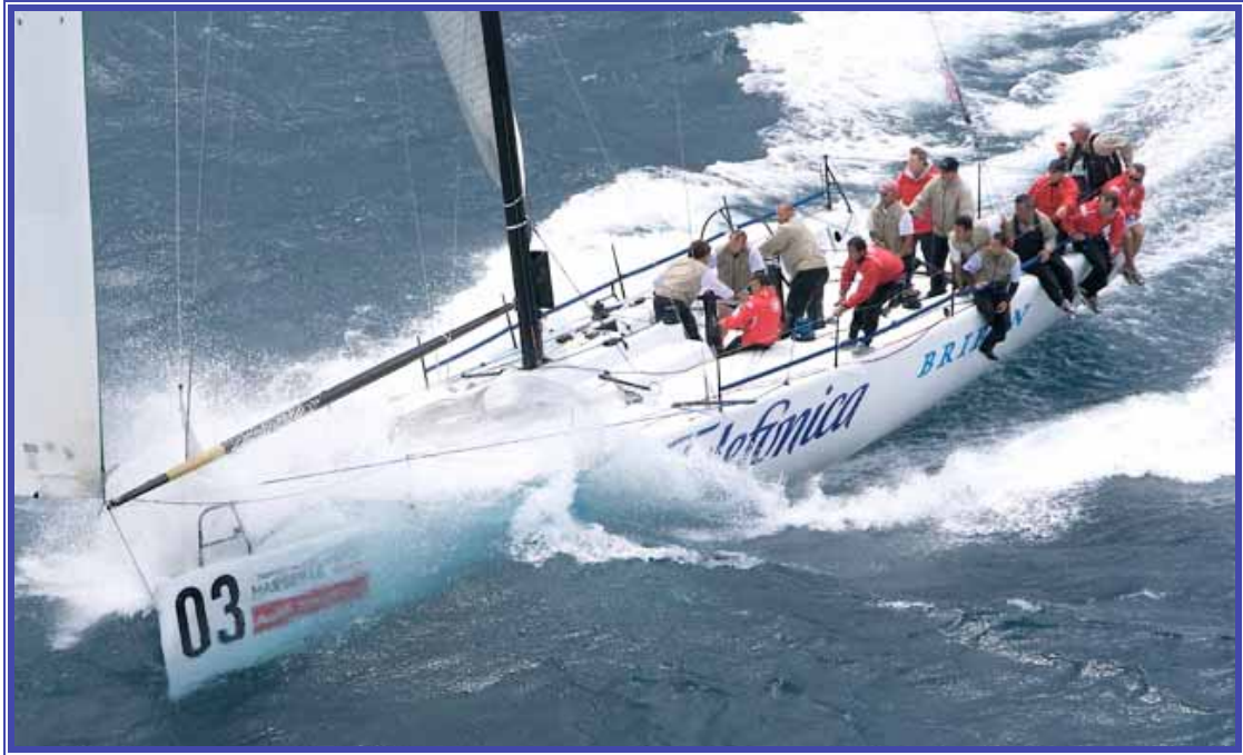
'BRIBON.' Number one, on the Audi MedCup leader board.