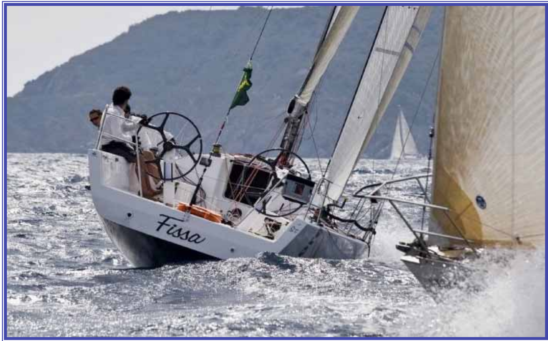
The well performed, 'FISSA'