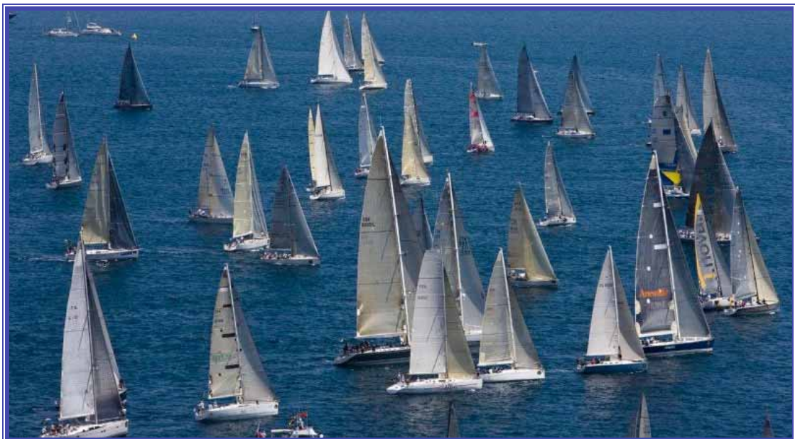
Part of the 169, boat fleet, at the start.