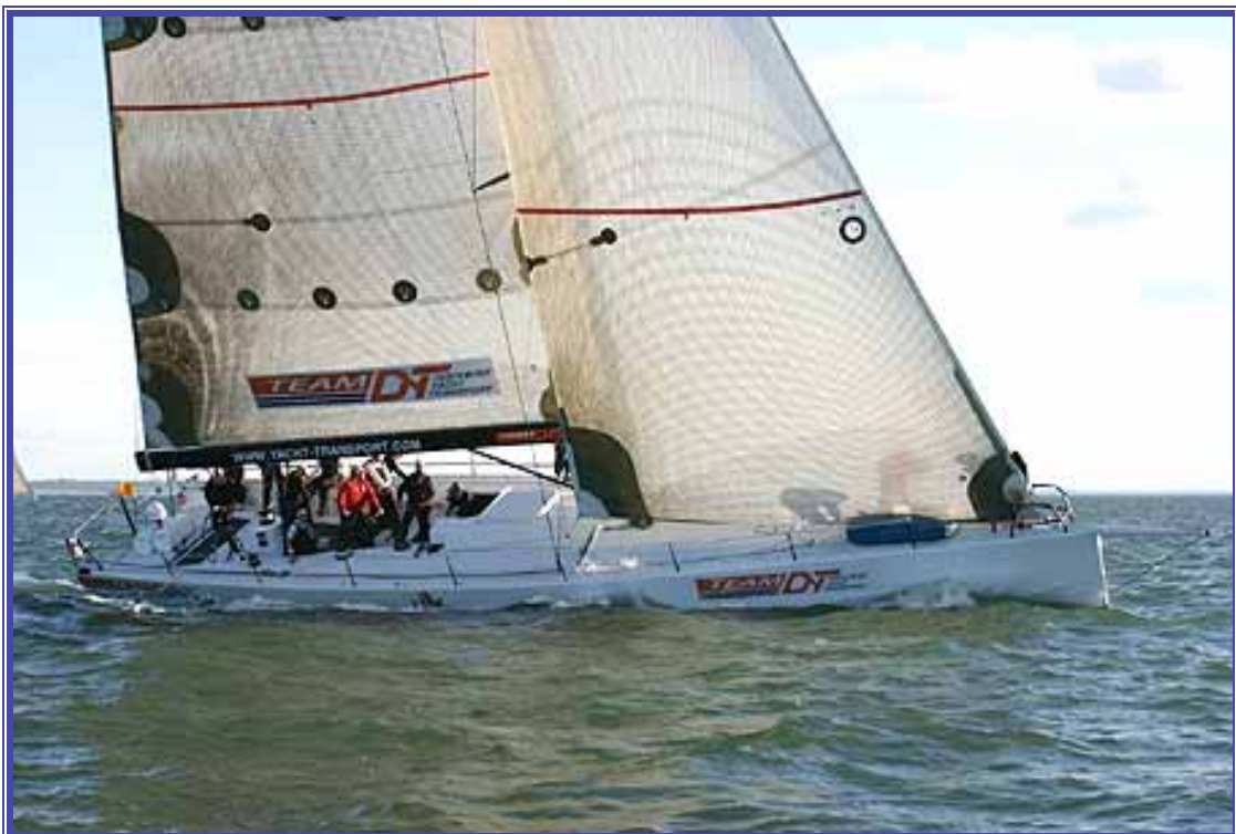
STP 65 'ROSEBUD/TEAM DYT'.

'On the way out through the Gut the wind was tricky, and coming back through upwind, it threw everything at us, including 20-30 degree shifts.' said Sturgeon who finished the race at 12:40 am Sunday morning after sailing just over 18 hours.