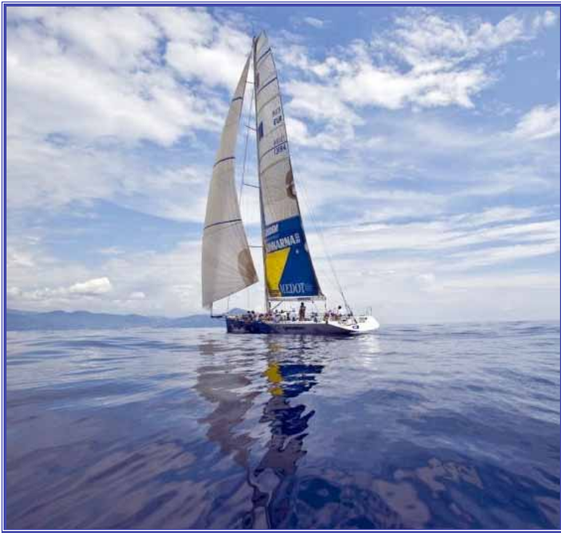
'ESIMIT EUROPA', sailing toward Giraglia rock.