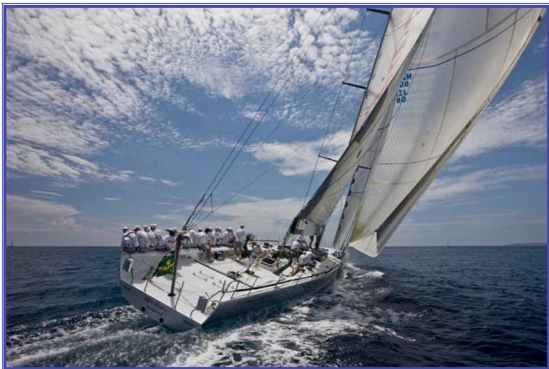
'ALFA ROMEO'. Race record setter!