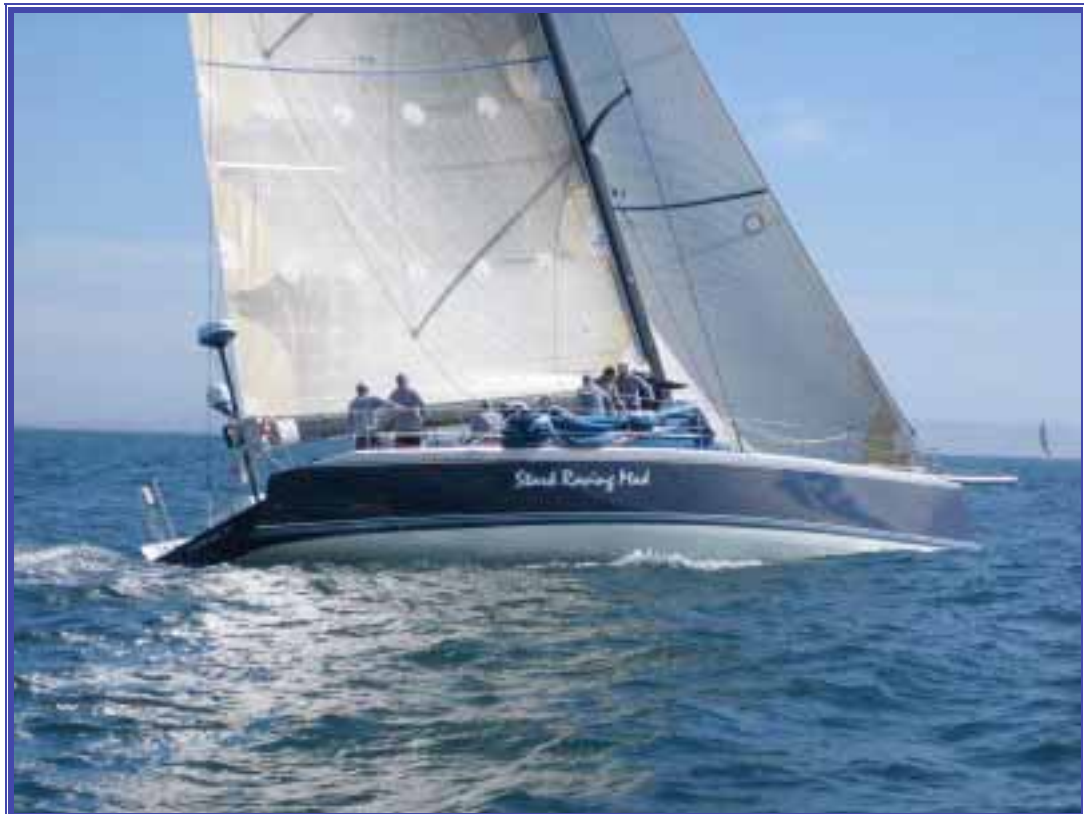
STARK RAVING MAD in Southern Californian waters.

Built in 2006 at Westerly Marine in California, she is the sister ship to well known and very successful Australian racer, Wild Oats X .