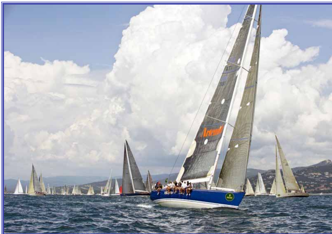
'EDIMETRA VI' leads IMS Class 02.