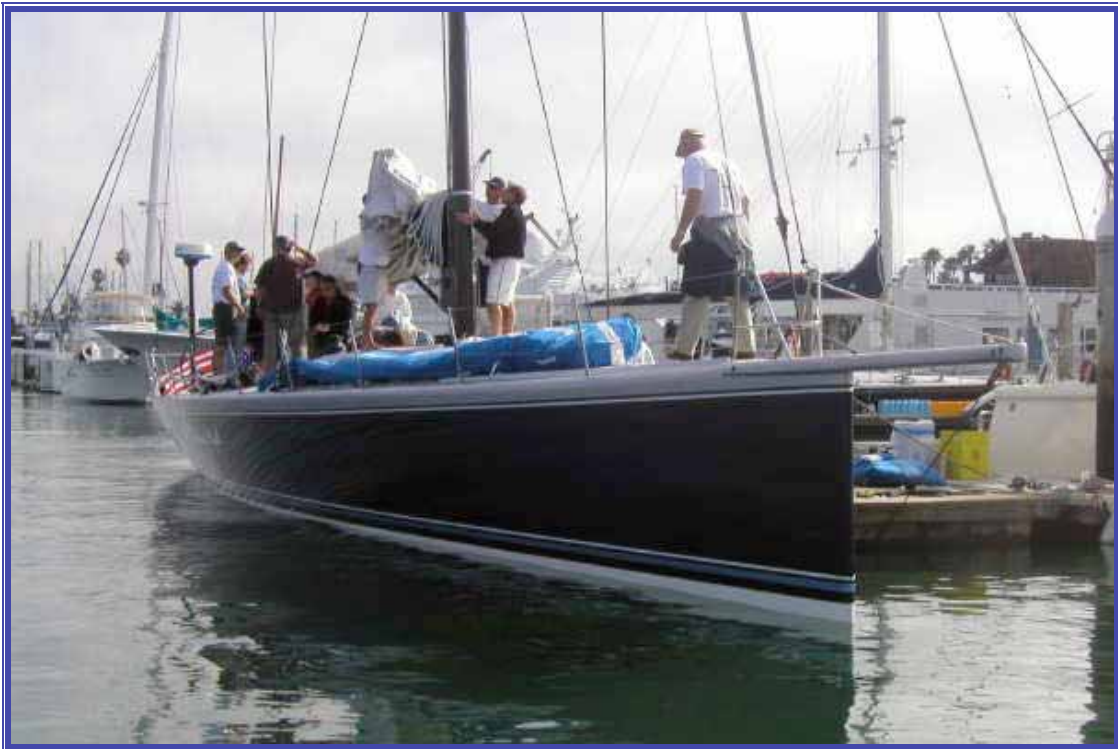
STARK RAVING MAD in Southern Californian waters.