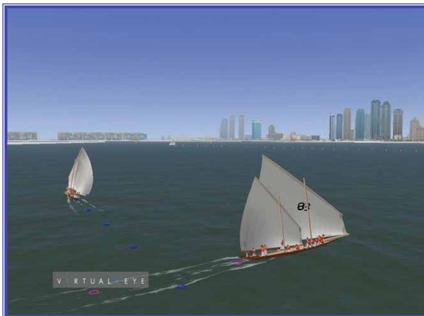
Down-wind tactics, on screen.

'It would certainly be the most unusual OB I have worked on' says technical engineer, Brent Russell . 'We were 40 - 50 miles from shore, trialing a system we had never used before, on boats we had only seen in pictures until a day before the race start. I have to admit to a few nervous moments until we saw the first of the tracking animations go live to air.'