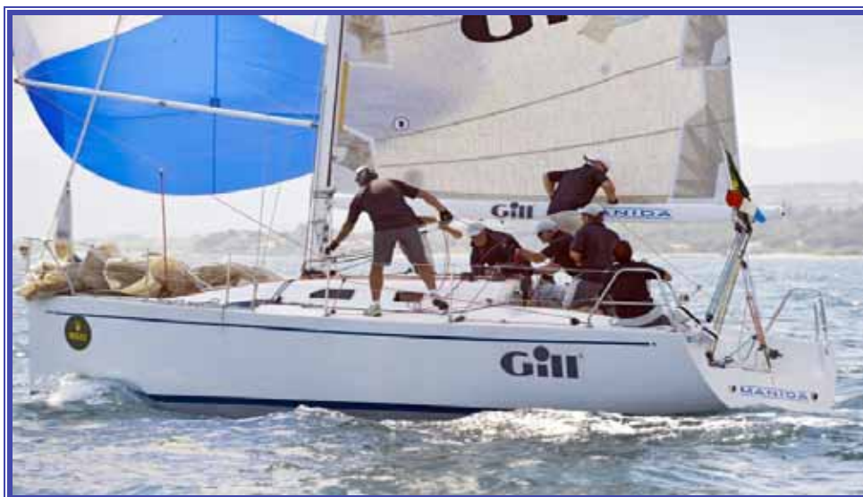
IMS Class 3-4 Champion 'MANIDA'.