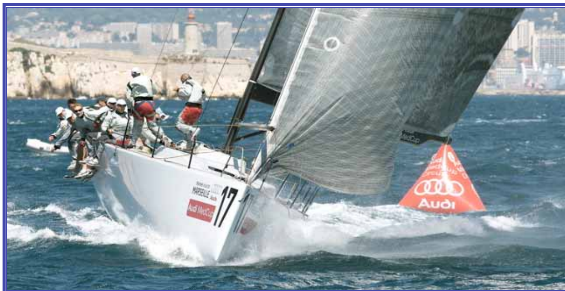
Larry Ellison's 'USA17,' sets up for downwind flying.

'We had two good races and were pleased to get back to seventh in that third one. I thought we had been told we could cross ahead of Desafio and then we realized we weren't. It was just a misunderstanding and it was only when they hailed us to do our turns I realized.' explained tactician Brun.