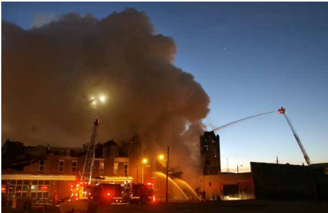
Fire crews battle the blaze.

Joe and Alison Elder who owned 'Skipjack Nautical Wares', lived in the apartment above their gallery and had fortunately evacuated the building during the early stages of the church fire, but stood and looked on in horror as the gas explosion caused the destruction of the top floor, their home!