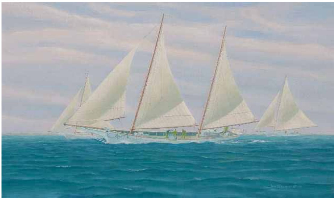
Oil on Canvas. 53 X 89cm. (20 7/8" X 35")