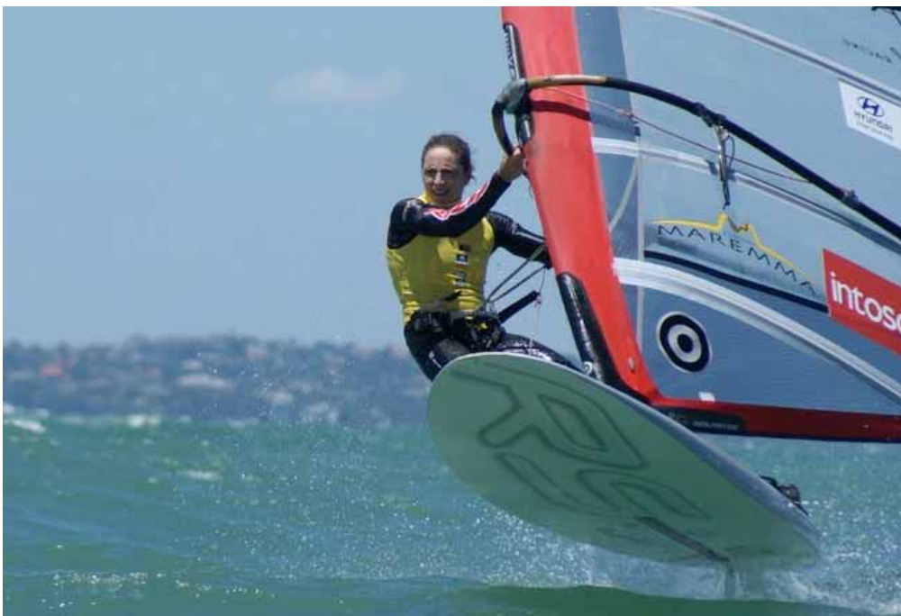
Alessandra Sensini is Sensational!

Auckland's Takapuna Beach was literally taken over by the world's best board sailors and they turned on an unforgettable demonstration of skill in a variety of wind conditions and under sunny summer skies.